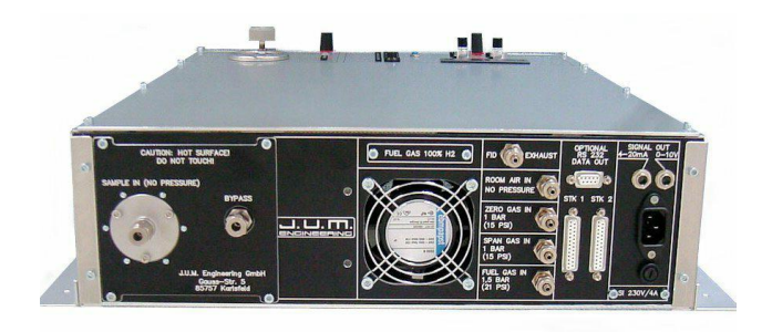
Top View, Standard Configuration

us before specifying your purchase order